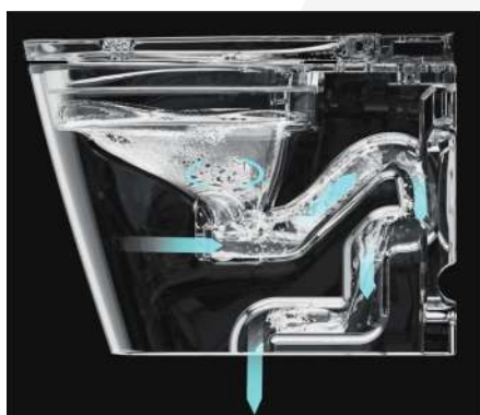
Dual cleaning technology