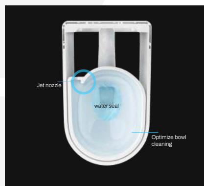
Jet nozzle for bowl cleaning